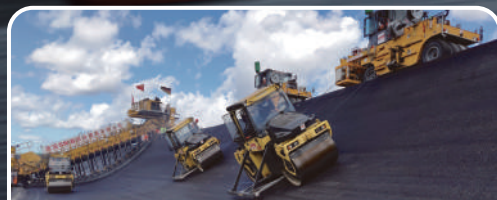
T1, the asphalt concrete high-speed runway with the largest inclination in the world