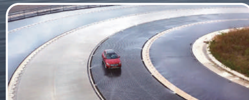
T10, wet circular loop